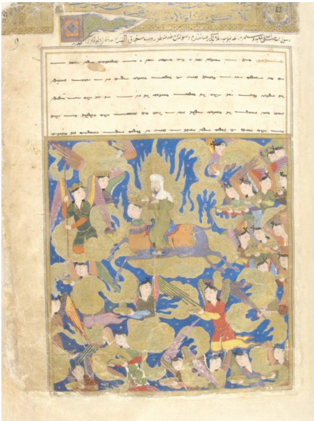
Figure 3: Mi'rājnāma, The prophet rides Buraq, Herat, 1436-1437. Paris Bibliothèque Nationale de France (Suppl.Turc 190, folio 5r)