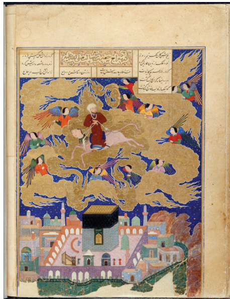
Figure 5: Nizami, Khamsah, Mi'raj, fol. 5v Herat, 1494-1495 (London British Museum Add Or. 6810)