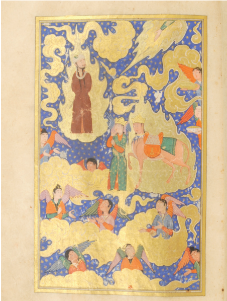
Figure 2: Ahmadi, Iskandar-nāma, Mi'raj II, fol.193r., Edirne? 1450-1460 A.D., (Venice National Library Cod.Or. XC (=57).